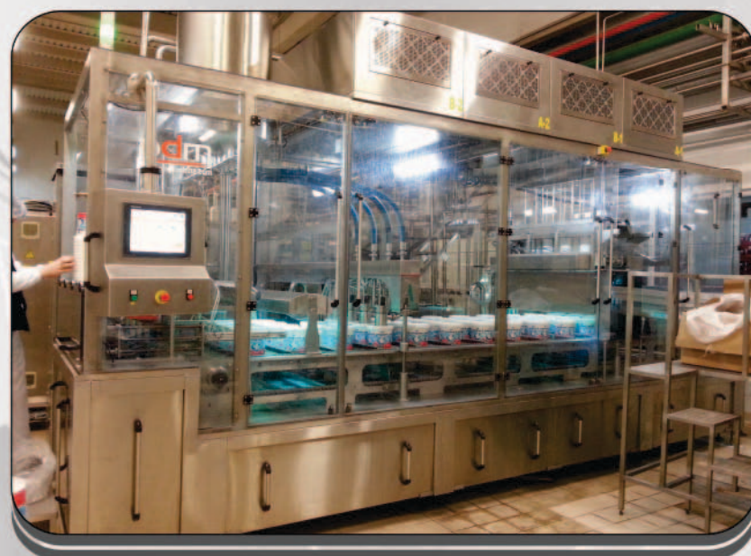
PDM-LS-400 YEAST YOGURT MILK FILLING MACHINE